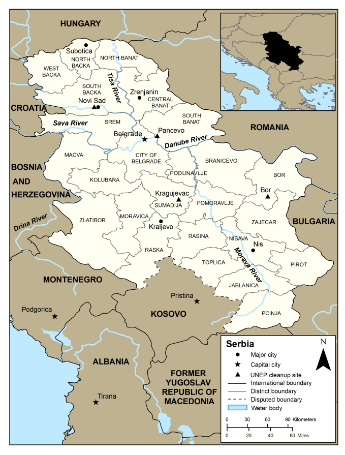
Figure 1. UNEP environmental hot spot cleanup sites in Serbia